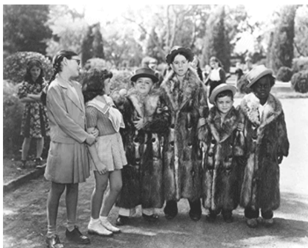
what exactly constitutes a gang? Our Gang, circa 1930s